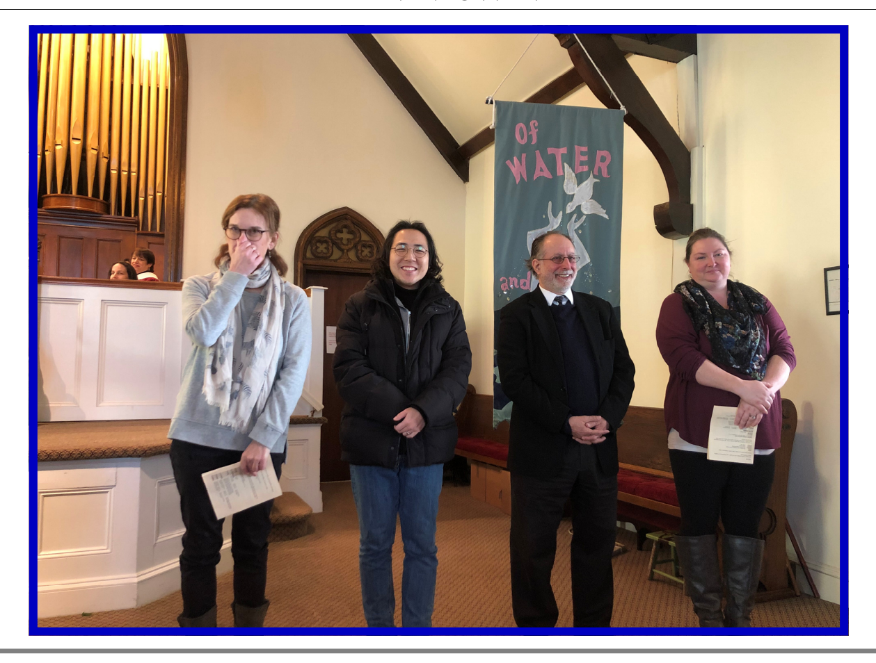
We give thanks for our newest deacons!