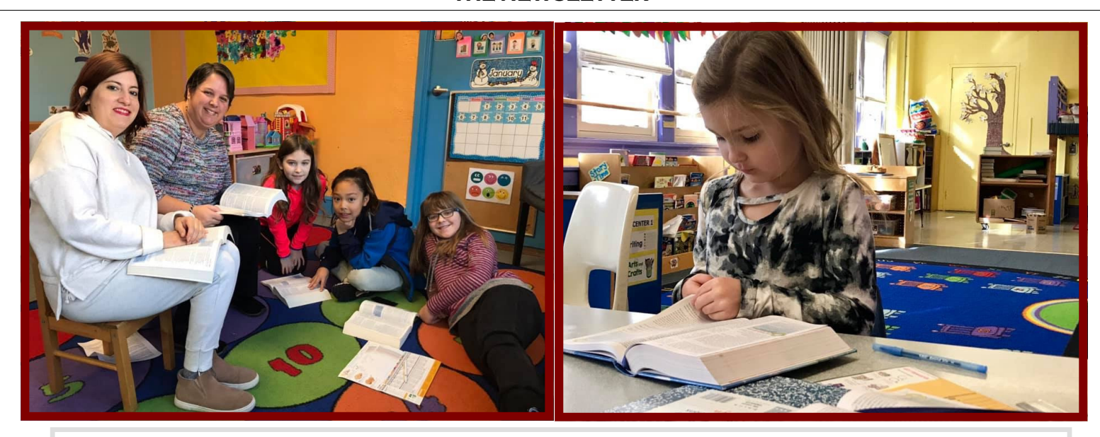
Sunday school- learning the faith and having fun doing it!