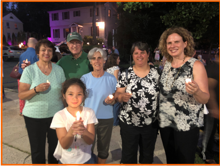
Church members show up and speak out for the Lights for Liberty Vigil